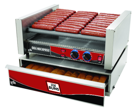
Models X30S Shown with XBW30

Star's Grill-Max® Express™ Roller Grills are covered by Star's oneyear parts and labor warranty.