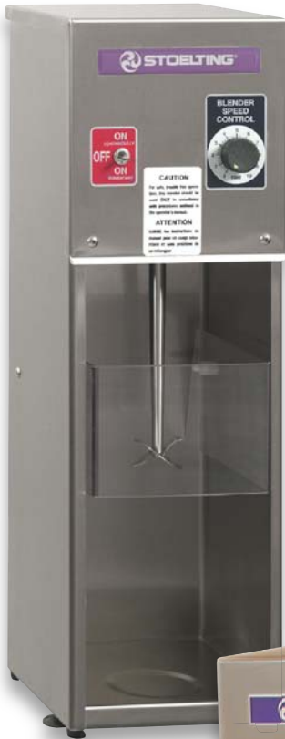
Dial Control Hand Operated Model