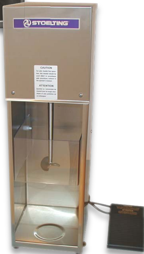
Foot Operated Model