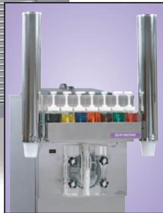
Optional Cup Holders