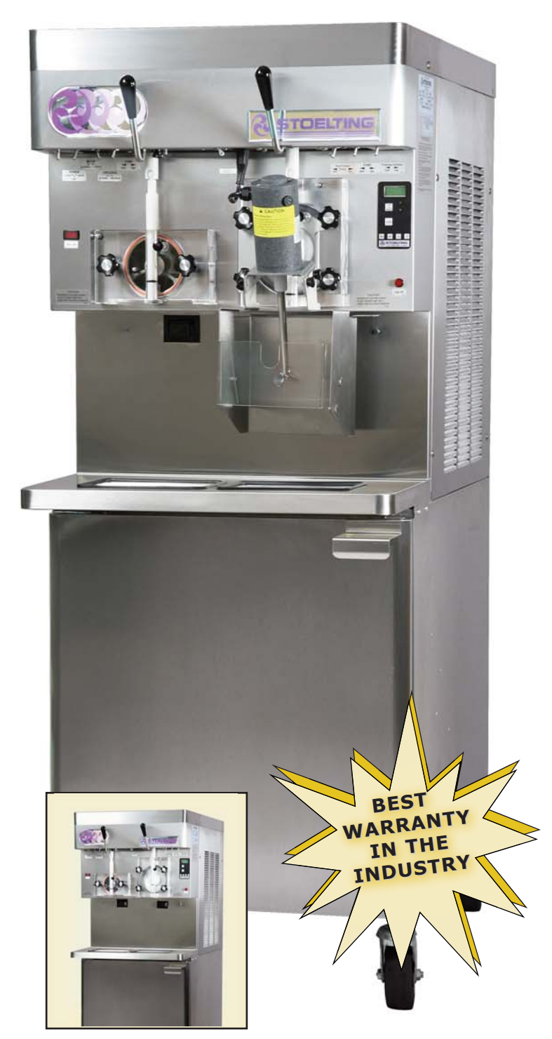
Model U444 (without mixer).