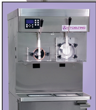
Model U444 (without mixer)