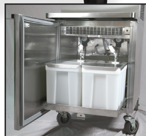
Refrigerated Cab showing slide-out mix shelf & bag connection system