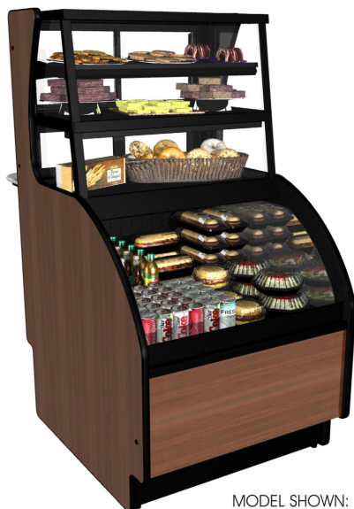
MODEL SHOWN: C3Z3667