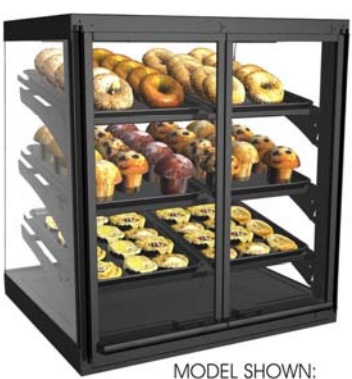
MODEL SHOWN: CG$2830 SELF-SERVICE