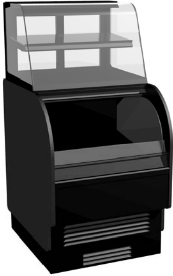
MODEL SHOWN: COU2757R-QS

COU2757R-QS Lengths include end panels 28"L x 34-1/2"D x 56-7/8"H