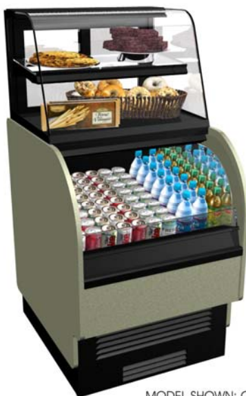
MODEL SHOWN: COU2757R

Lengths include end panels 28"L x 34-1/2"D x 56-7/8"H