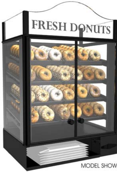
MODEL SHOWN: CSC3223

Lengths include end panels 31-1/2"L x 23-1/8"D x 36-3/8"H