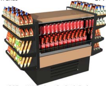
OPT = W/ Shelves On Both End