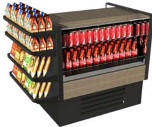
OPT = W/ Shelves On One End