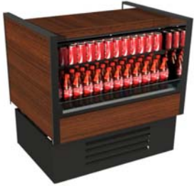
STD = W/o Shelves On Ends

Lengths include end panels 38-1/2"L x 30-1/4"D x 38-1/4"H