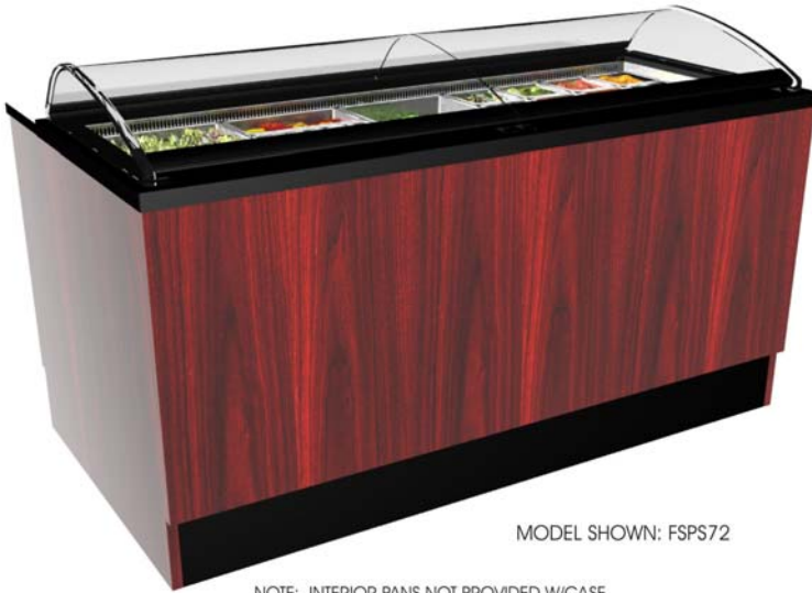
MODEL SHOWN: FSPS72

48-1/8"L x 39-3/4"D x 42-1/4"H 72-1/8"L x 39-3/4"D x 42-1/4"H