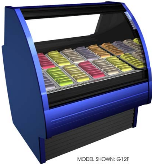
MODEL SHOWN: G12F