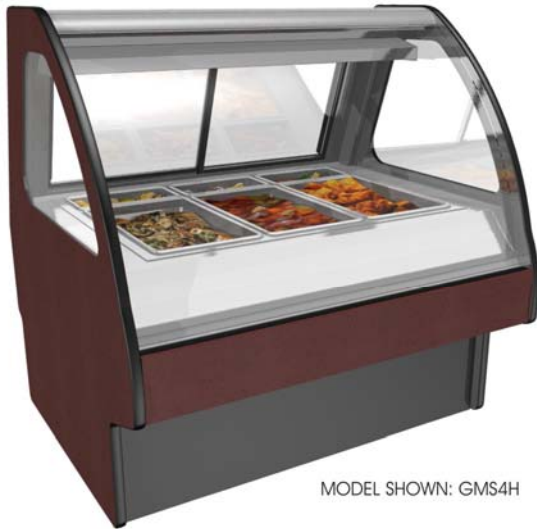
MODEL SHOWN: GMS4H

51"L x 42-3/4"D x 51-5/8"H 75-3/8"L x 42-3/4"D x 51-5/8"H