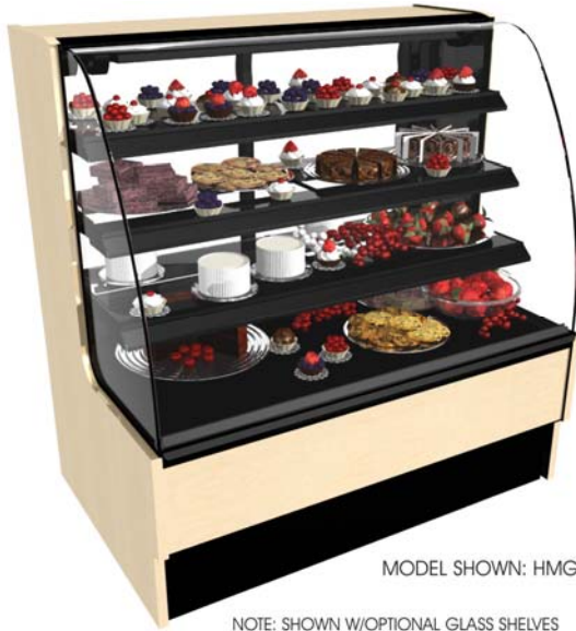
MODEL SHOWN: HMG5153