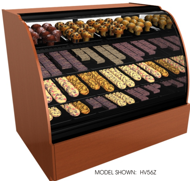
MODEL SHOWN: HV56Z