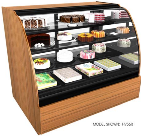
MODEL SHOWN: HV56R