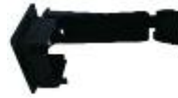
21000563 Flojet end mount adapter