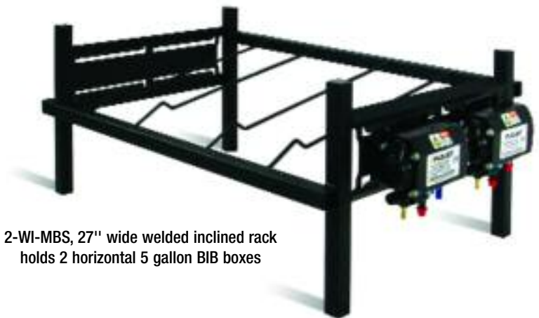
2-WI-MBS, 27" wide welded inclined rack holds 2 horizontal 5 gallon BIB boxes