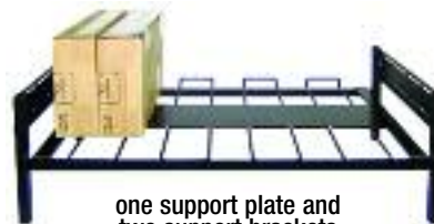
one support plate and two support brackets