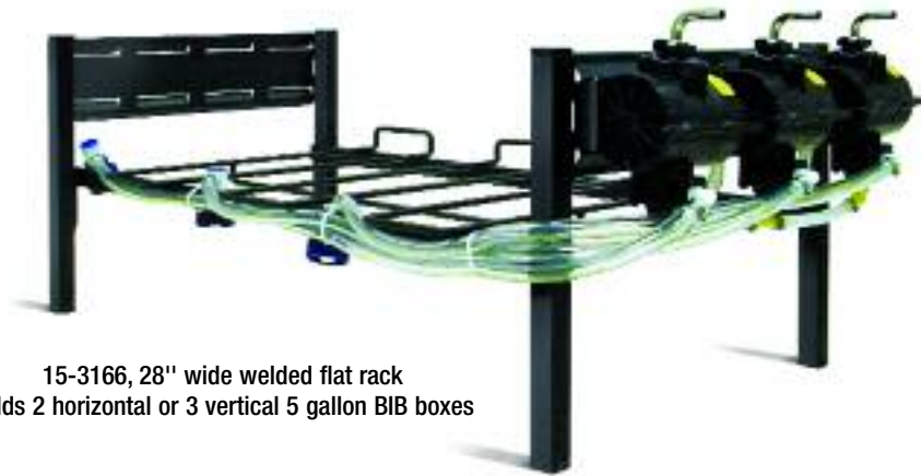
15-3166, 28" wide welded flat rack holds 2 horizontal or 3 vertical 5 gallon BIB boxes