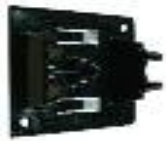
08-1080-00 universal regulator mount