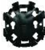
21-1490-00 SHURflo end mount adapter