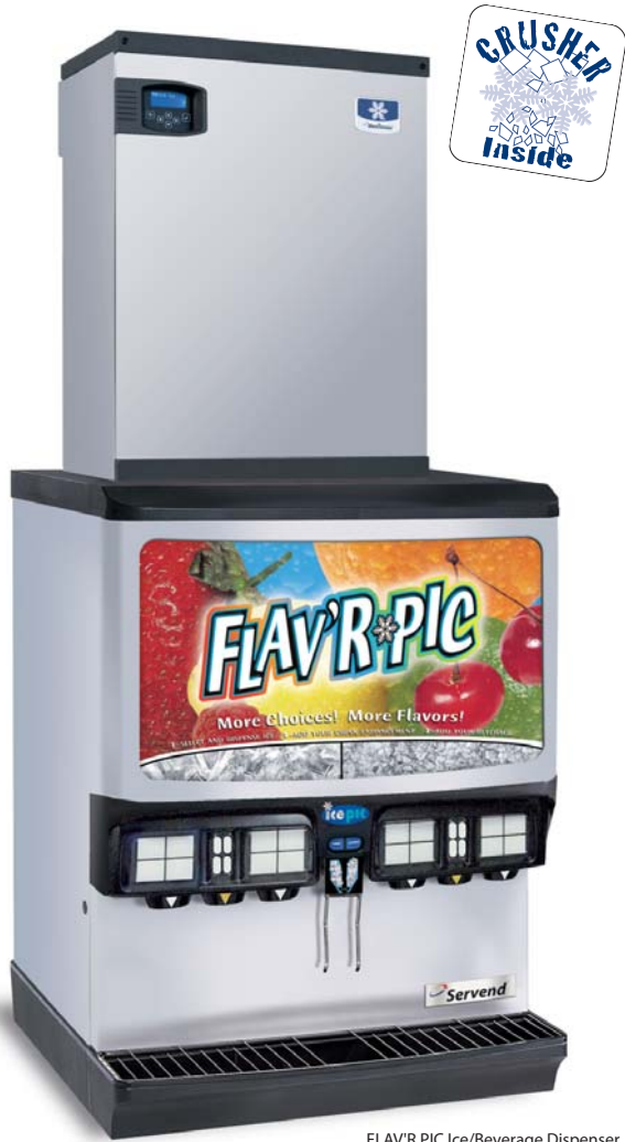
FLAV'R PIC Ice/Beverage Dispenser with IB-800 Ice Machine