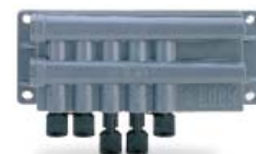
Servend's Flexible Beverage Manifold