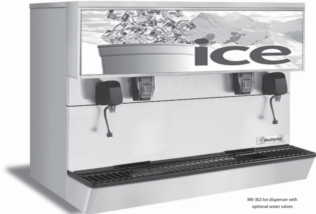
MII-302 Ice dispenser with optional water valves