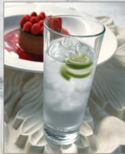
Discover the tall, clean lines of élan glassware.