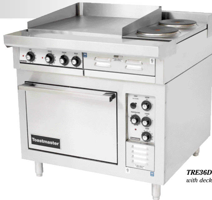
TRE36D5 with deck oven base