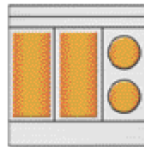
TRE36C2/D2 • Two 12" x 24" hotplates • Two round hotplates