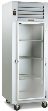
Model RHT126WPUT-FHG (shown with optional casters)