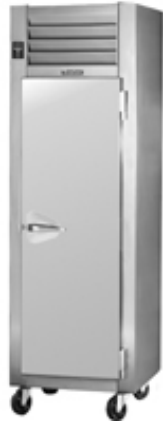
Model RLT132DUT-FHS (shown with optional casters)