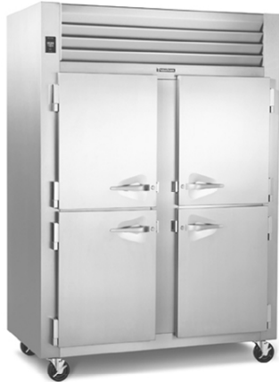
Model RLT232NUT-HHS (shown with standard left/right hinging and optional casters)