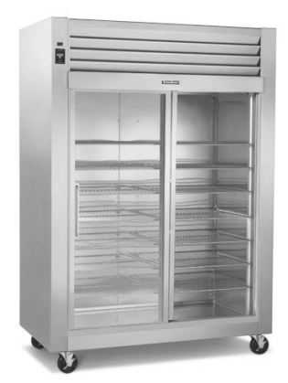
Model RHT232WUT-FSL (shown with optional casters and additional shelves)