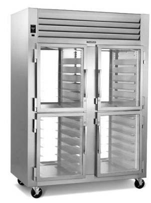
Model RHT232NPUT-HHG (shown with optional casters and interior arrangements)