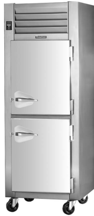
Model RHT132WPUT-HHS (shown with optional casters)