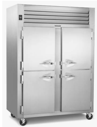
Model RLT232WUT-HHS (shown with optional casters)