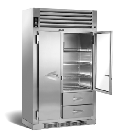
Model UR48DT-14 (shown with optional base)