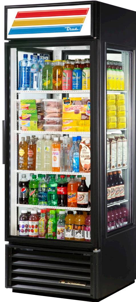
Shown with optional black exterior.