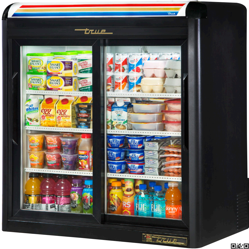
Shown with optional black exterior.

Slide Door Counter-Top Refrigerator with LED Lighting