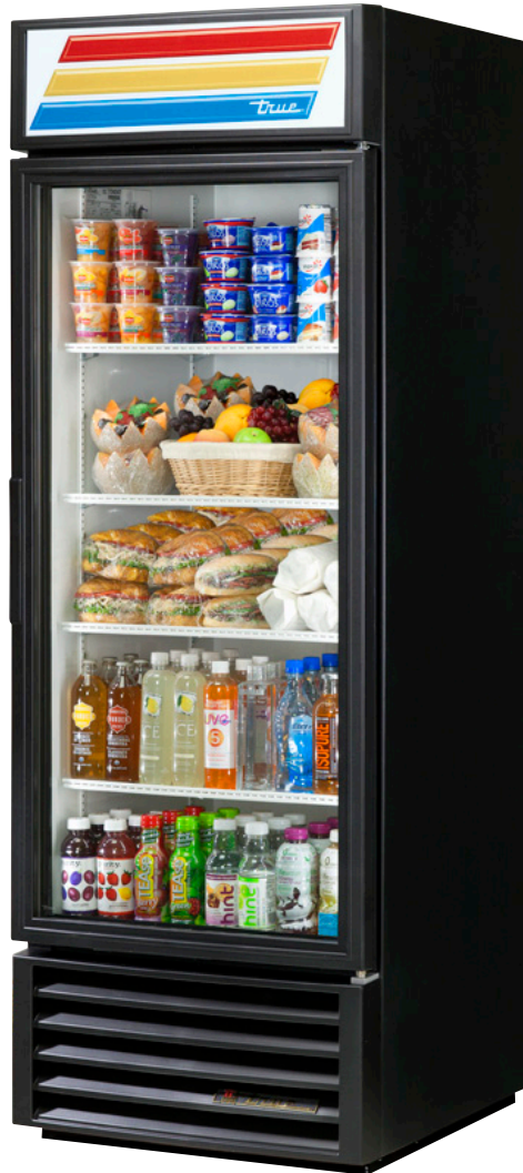
Shown with optional black exterior.