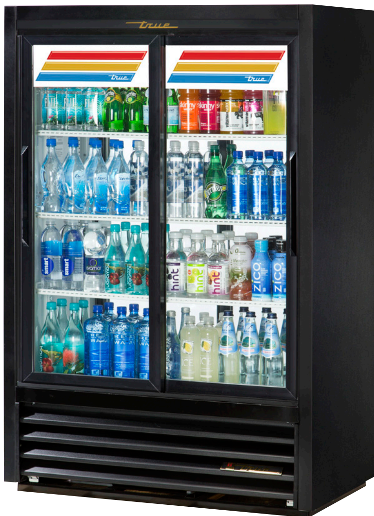
Shown with optional black exterior.

Slide Door Lower Height Narrow Depth Fast Lane Pass-Thru Refrigerator with LED Lighting