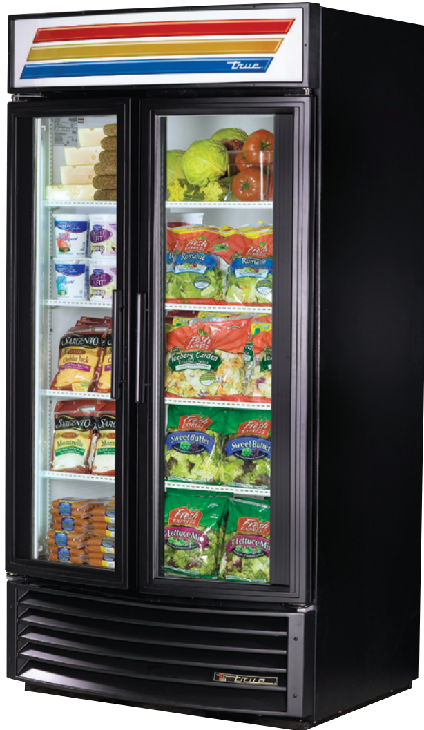
Shown with optional black exterior