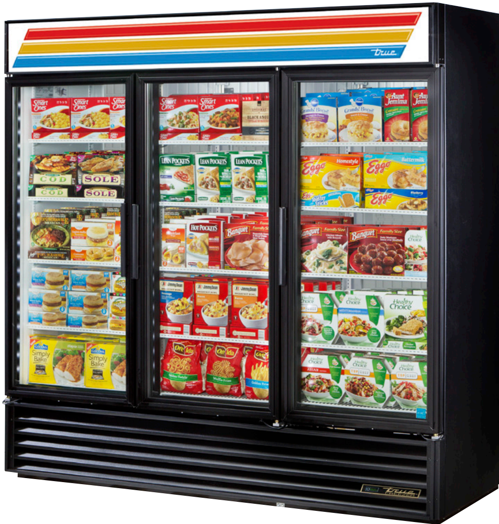
Shown with optional black exterior.

Swing Door Freezer with Hydrocarbon Refrigerant & LED Lighting