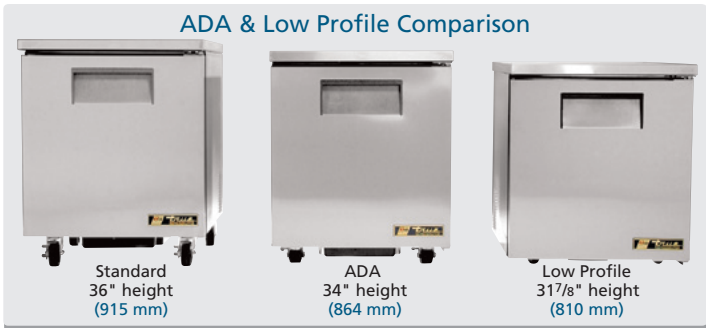
Standard 36" height (915 mm)