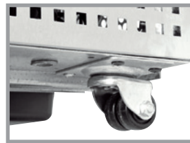
1 1/2" diameter dual swivel castors for "LP" models.