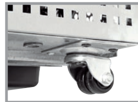
1½" diameter dual swivel castors for "LP" models.