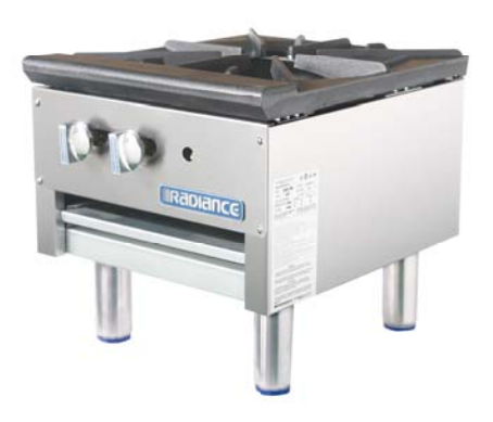
Model : TASP-