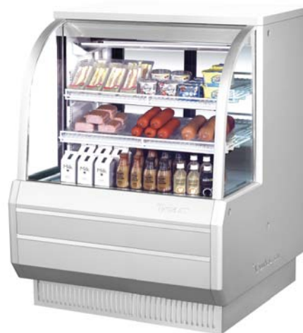
* Red wine and white color come standard