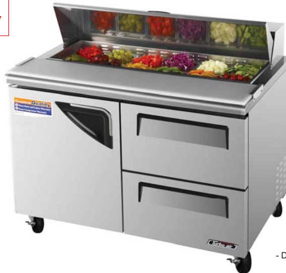
- Drawer pans not included.

EXCEPTIONAL 3 YEAR PARTS & LABOR WARRANTY