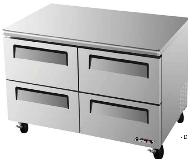
- Drawer pans not included.