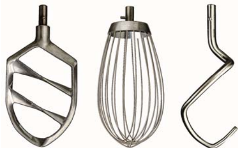
Standard tools: Beater, whip and hook.