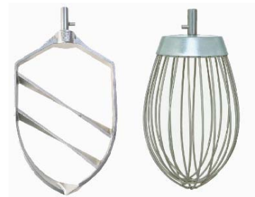
Standard tools: Stainless Steel flat beater and wire whip.