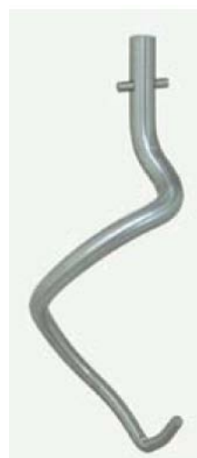
Standard tool: Stainless Steel dough Hook.