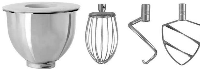
Standard tools: Stainless Steel Wire Whip, hook and beater. Bowl shown with optional plastic Bowl Lid

*On the nominal motor voltage, + or - 10% tolerance is allowed.