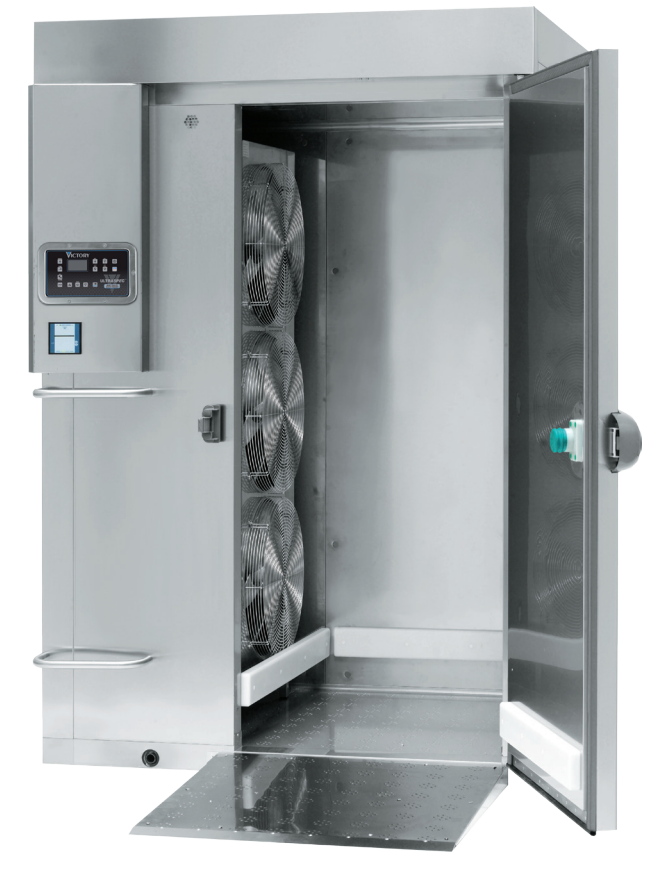
Shown with optional printer.