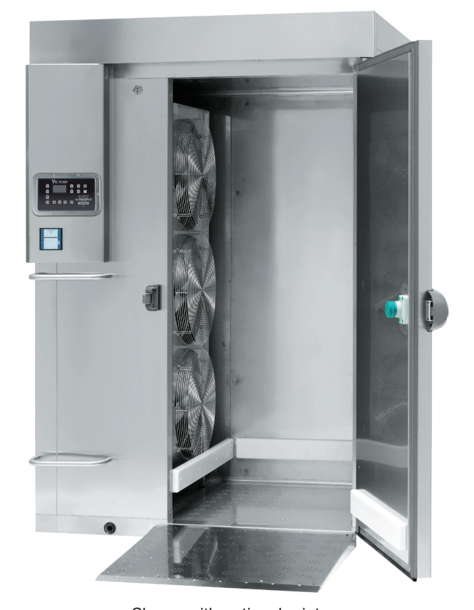
Shown with optional printer.