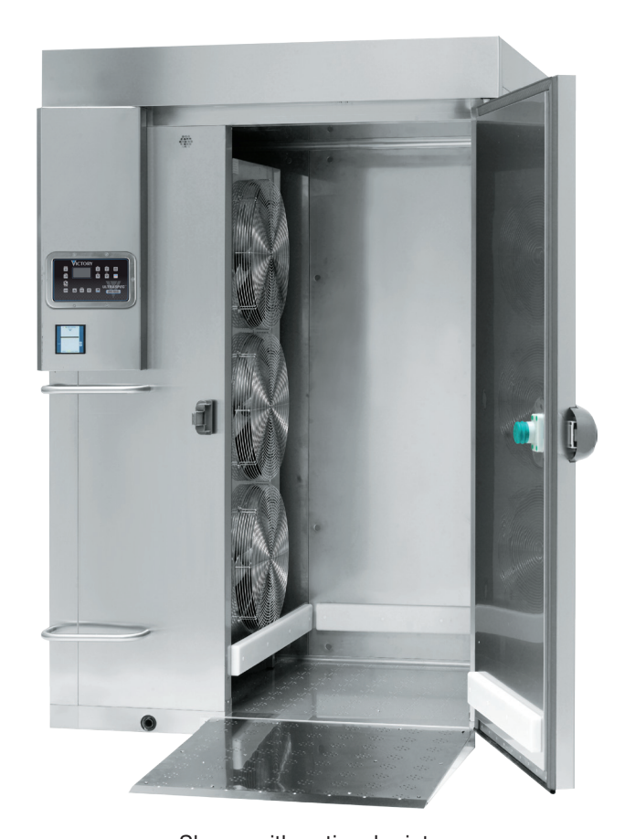
Shown with optional printer.